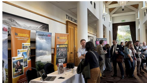
Spa resort hosts future trends and innovation conference