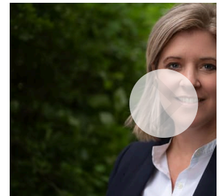
Companies warned ag value washing'