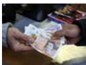
Household Support Fund 2024: how to apply online and contact council for cost of living payment as HSF returns