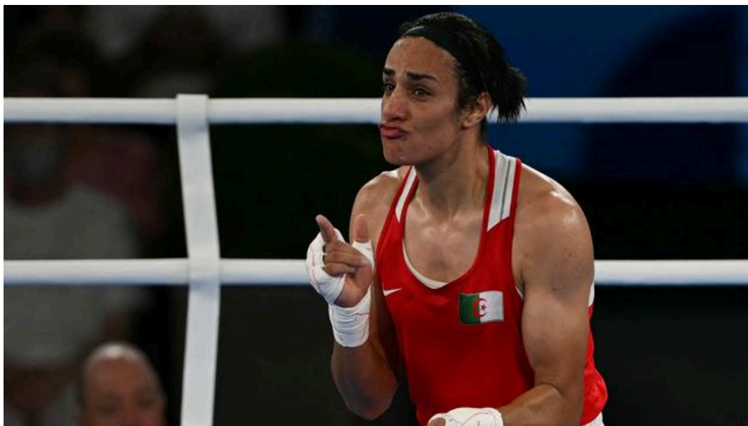
It's unclear if the IOC will investigate reports Imane Khelif is a biological male.

"I am fully qualified to take part in this competition. I'm a woman like any other woman. I was born a woman, I lived as a woman, I competed as a woman, there's no doubt about that."