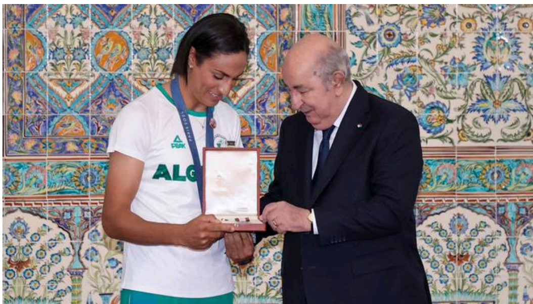
President Abdelmadjid Tebboune presents an award to Imane Khelif in the Algerian capital after the Olympics.

The IBA, the longstanding ruling body of traditionally amateur competitions, such as the Olympics, is involved in a brawl with the International Olympic Committee (IOC) over financial, governance and ethical concerns.