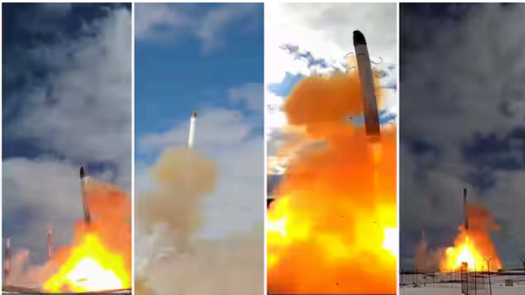
📷 Combination screenshot of Russian military video of Satan missile tests