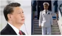
Xi suspends China's powerful military official as purge campaign intensifies