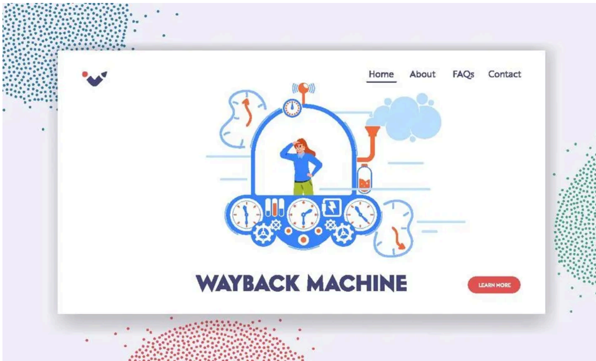
Hackers have compromised the Internet's past

Story updated Oct. 11 with additional expert comment regarding the DDoS attack on the Wayback Machine and the security resources that have helped limit the damage.