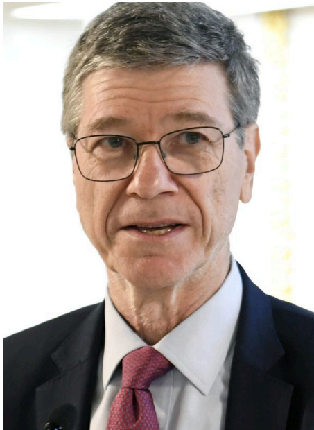
Prof. Jeffrey Sachs of Columbia University.