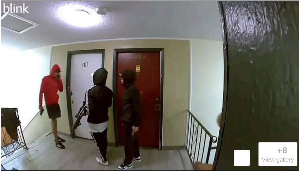
The dangerous Venezuelan mobsters known as Tren de Aragua may have finally met its match in Southside Chicago gangs amid fears the city could go up in flames if they come to blow