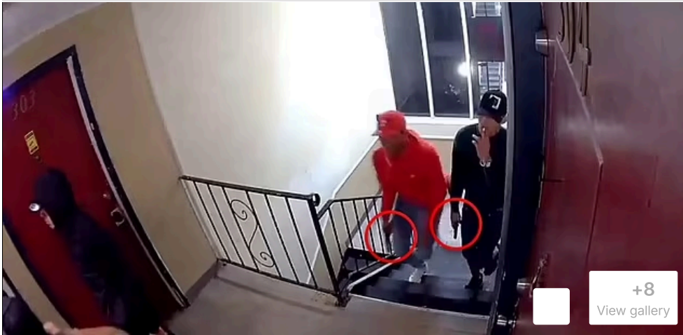
The city's taxpayers have dolled out just under $150 million on migrant-related expenses since August 2022, city data shows. Some of those are reportedly going to members of Tren de Aragua members

Many of the gangsters themselves are furious that Tren de Aragua, which they see as a 'terrorist group,' has been allowed in and taken away benefits that citizens have been getting.