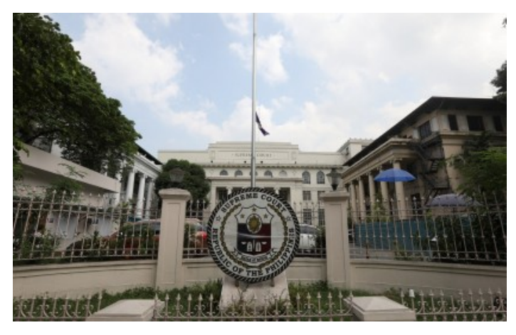
SC validating report of data breach