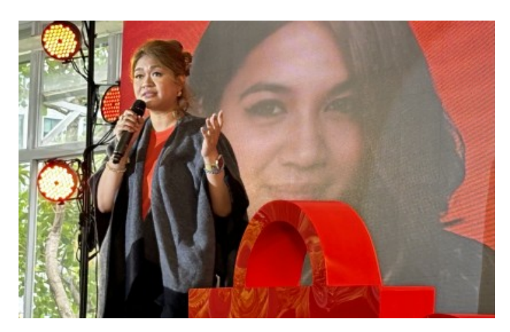
Filipinos favor well-reviewed products, user-friendly e-shop platforms