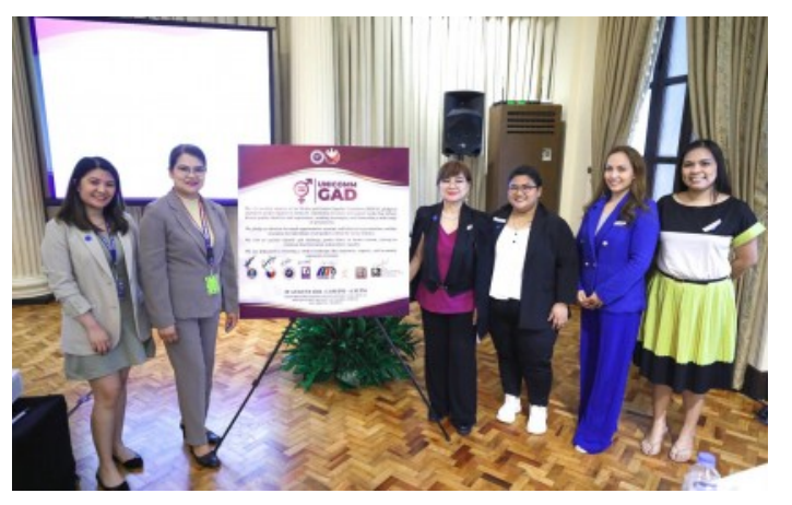
Media, gender equality body reconstituted for gender mainstreaming