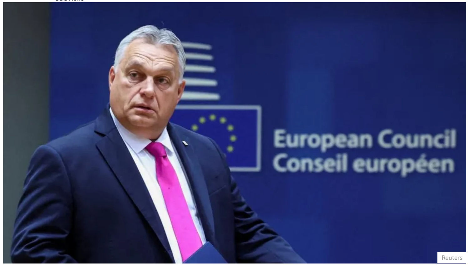
Hungary Prime Minister Viktor Orbán called the fine "outrageous and unacceptable"

The European Union's top court has fined Hungary €200m (£169m) for failing to follow the union's asylum policies.