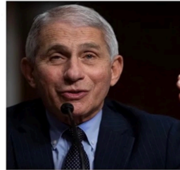
Very well planned, no?

Children's Health Defense: Perspectives of the WHO | From Advisory Body to World Government? (timestamp 7:15:45)