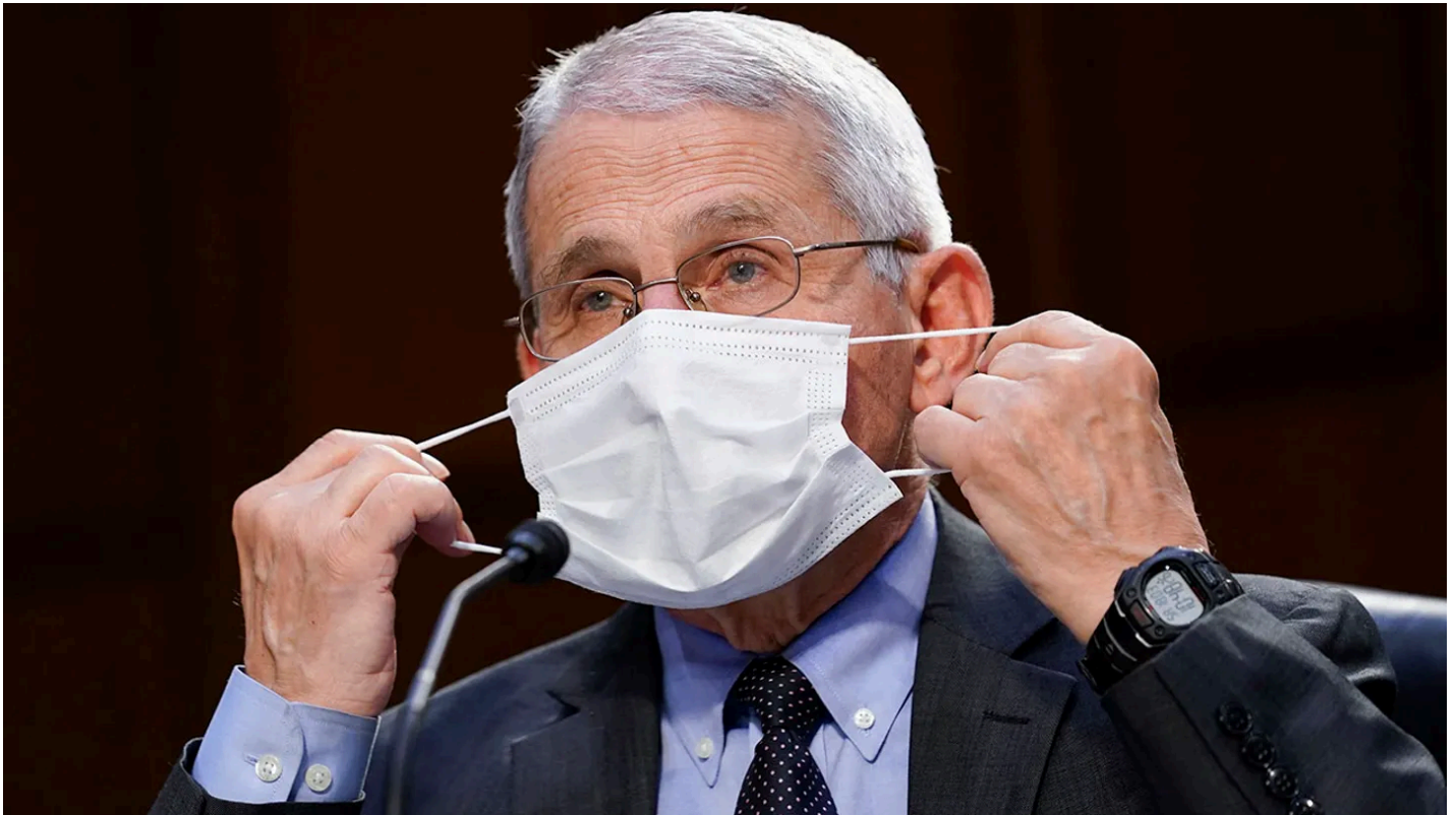
Dr. Anthony Fauci adjusts his face mask during a Senate hearing on the federal response to the coronavirus on Capitol Hill, March 18, 2021.

This project, the DEFUSE project, proposed to insert a furin cleavage site into a coronavirus to create a novel chimeric virus that would have been shockingly similar to the COVID-19 virus.