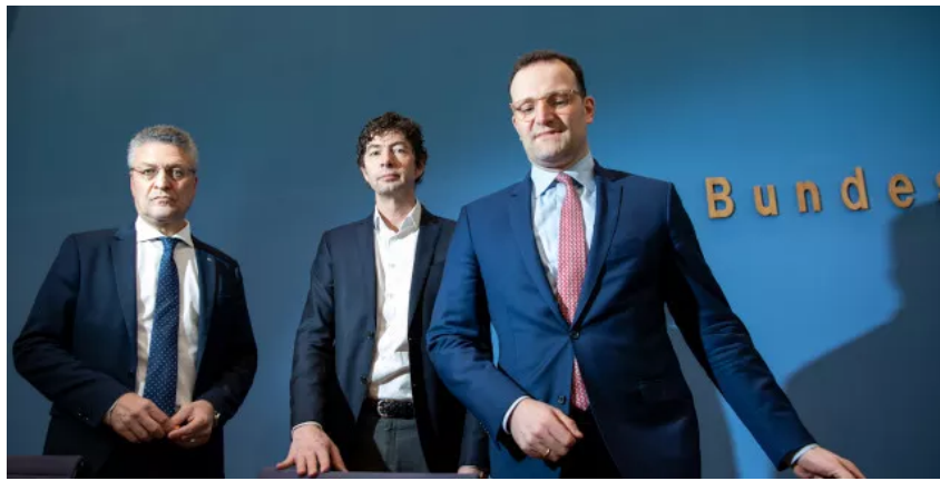
Lothar Wieler, Christian Drosten and Jens Spahn in March 2020

The next day, the RKI protocol noted: „ tested 80 samples yesterday, all negative “.