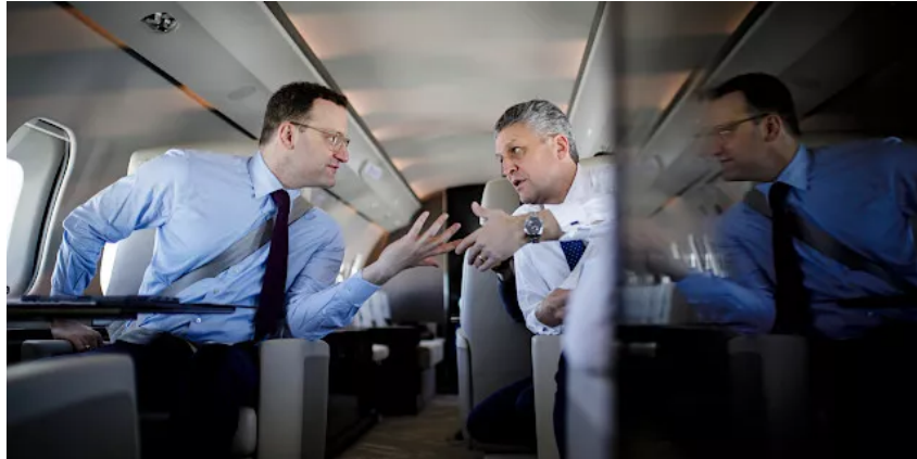
Jens Spahn and Lothar Wieler on 25. February 2020 on the flight to Rome for a crisis meeting with EU health ministers

had to now „ paralyze the economy “ and take precautions for curfews of indefinite duration. The Spahn confidante had a year earlier as a German representative at one high-ranking pandemic business game participated, which was organized by privately funded US institutions.