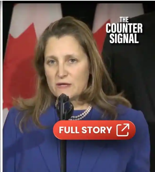
Trudeau, Freeland sued by Freedom Convoy protesters following Federal Court ruling

The development comes just weeks after a Federal Court judge ruled ( https://thecountersignal.com/federal-court-rules-trudeau-violated-charter-rights-with-emergencies-act-against-truckers/ ) that Trudeau's decision to invoke the Emergencies Act, which gave the government unprecedented power, was a violation of the Canadian Charter of Rights and Freedoms.