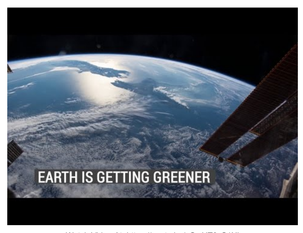
Watch Video At: https://youtu.be/zOwHT8yS1XI

An international team of 32 authors from 24 institutions in eight countries led the effort, which involved using satellite data from NASA and the National Oceanic and Atmospheric Administration's instruments to help determine the leaf area index, or amount of leaf cover, over the planet's vegetated regions. The greening represents an increase in leaves on plants and trees equivalent in area to twice that of the continental United States.