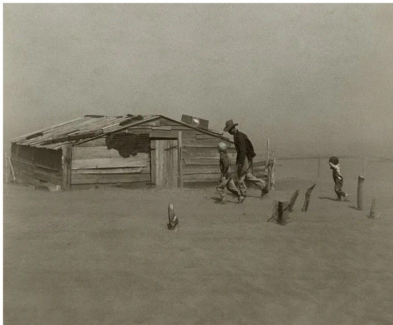
A farmer and his two sons during a dust storm in Cimarron County, Oklahoma, April 1936. Iconic photo entitled "Dust Bowl Cimarron County, Oklahoma" taken by Arthur Rothstein.

When you observe the puzzling behavior of those leading the scare campaign about CO2 emissions, it's strange to see them allowing forest fires to ignite and spread unchecked. It makes you question their intentions, considering we've always been told that carbon dioxide is harmful. So why are they contributing to increased CO2 levels by allowing trees, which absorb carbon, to be destroyed?