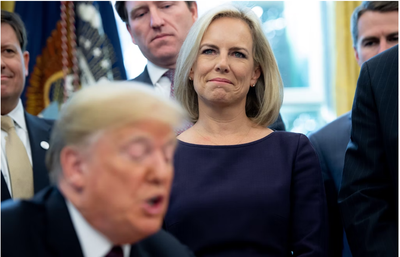
Homeland Security Secretary Kirstjen Nielsen stands alongside President Donald Trump as he speaks prior to signing the Cybersecurity and Infrastructure Security Agency Act in the Oval Office of the White House in Washington, D.C., on Nov. 16, 2018.

The stepped up counter-disinformation effort began in 2018 following high-profile hacking incidents of U.S. firms , when Congress passed and President Donald Trump signed the Cybersecurity and Infrastructure Security Agency Act, forming a new wing of DHS devoted to protecting critical national infrastructure. An August 2022 report by the DHS Office of Inspector General sketches the rapidly accelerating move toward policing disinformation.