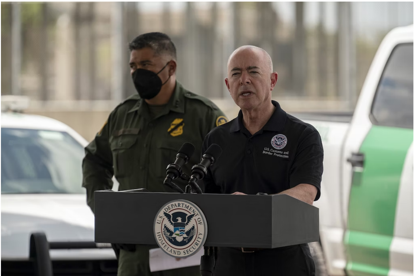
Alejandro Mayorkas, secretary of the Department of Homeland Security, speaks during a new conference in Brownsville, Texas, on Aug. 12, 2021.