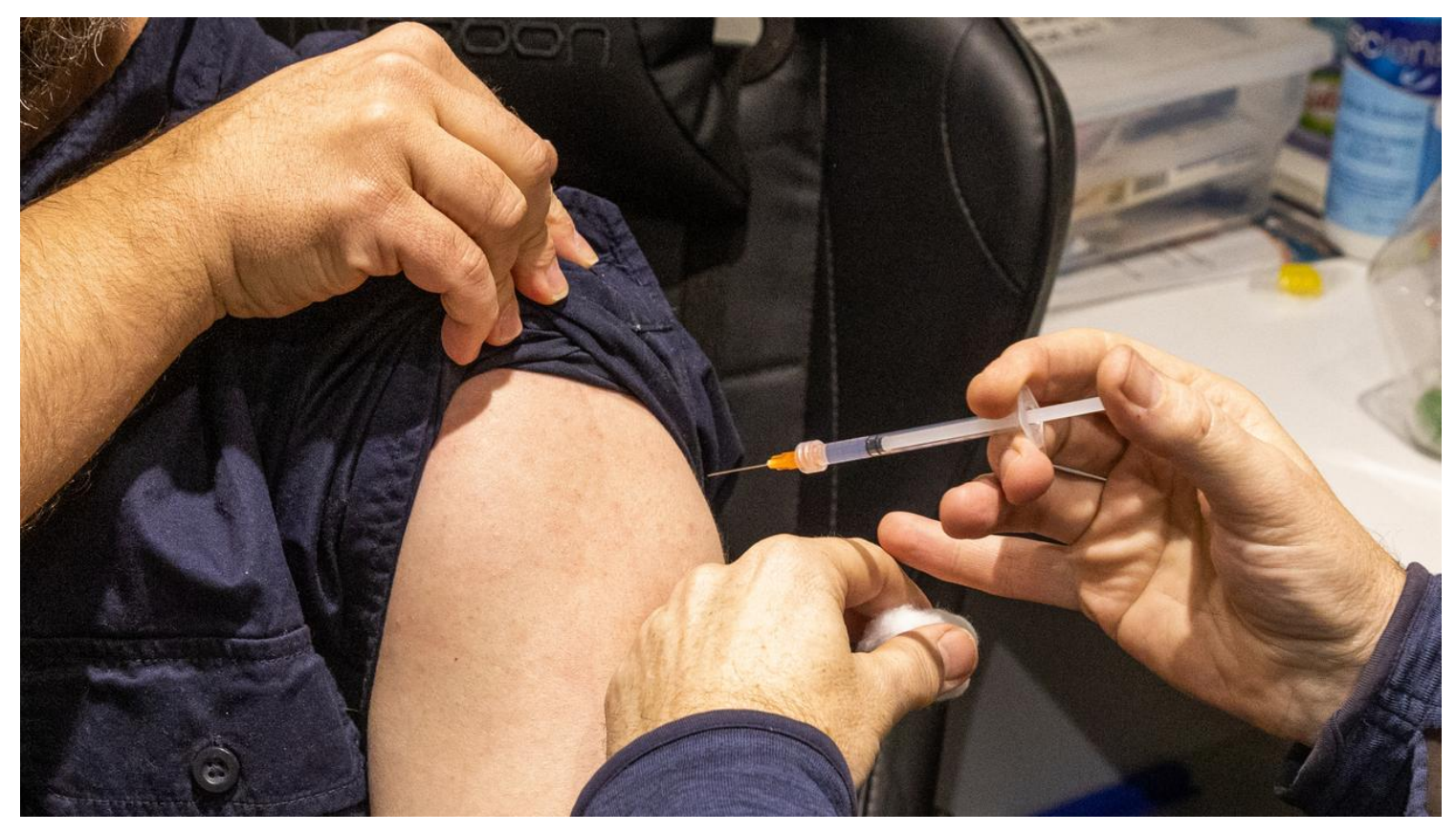
A pharmacist administers Covid vaccine booster.

"The protective benefits of vaccination far outweigh the potential risks."