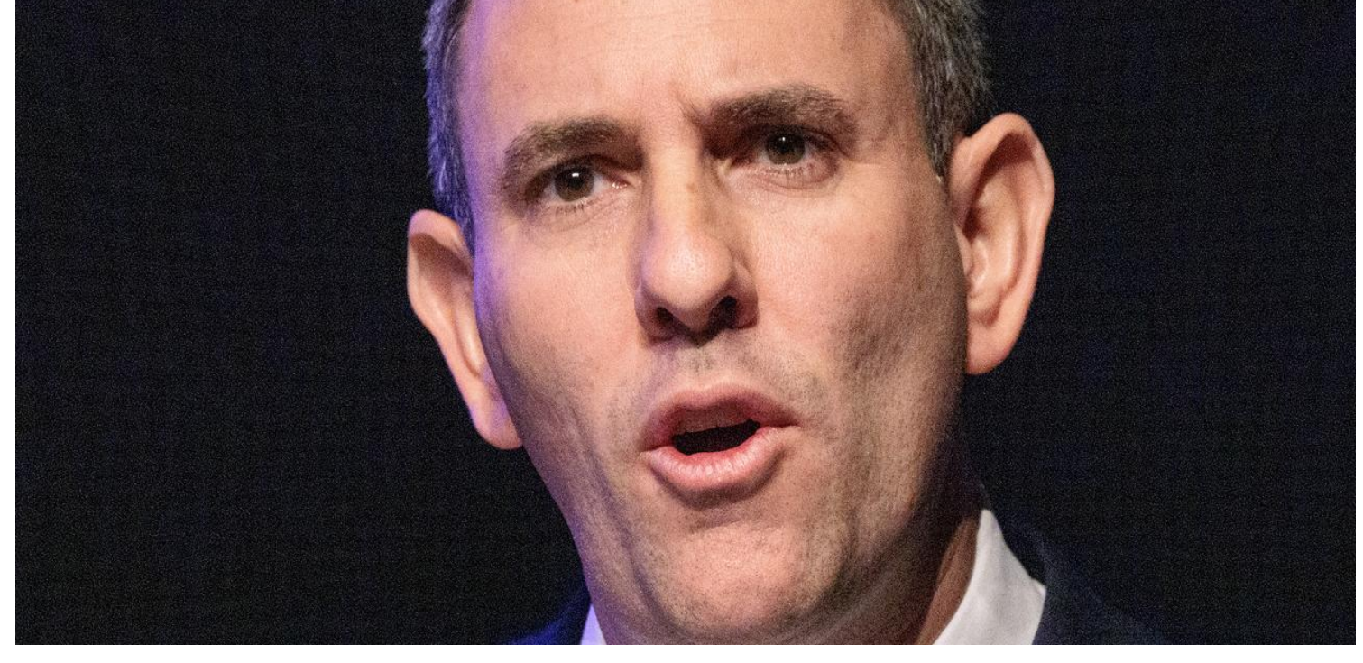
Budget's hidden 'telling statement'

Payouts for Covid-19 vaccine injuries are set to explode more than 80-fold to nearly $77 million by July next year, Tuesday's budget papers reveal.