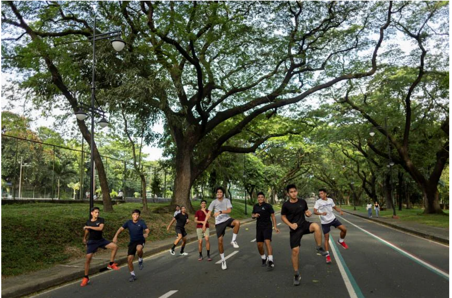
Athletes training without any masks on at a university campus in Quezon City.