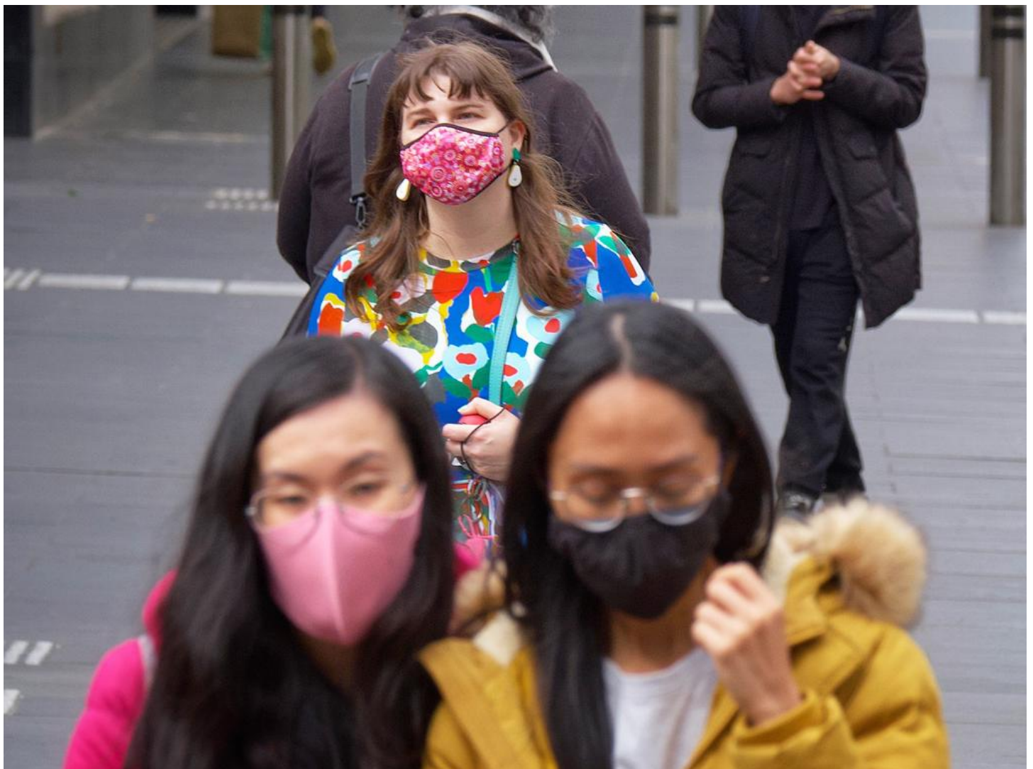
Most states rolled back mask mandates as the vast majority of the population became fully vaccinated.

“Infection with this virus will be very common, you will know a lot of people infected with this strain of the virus in the coming weeks.”