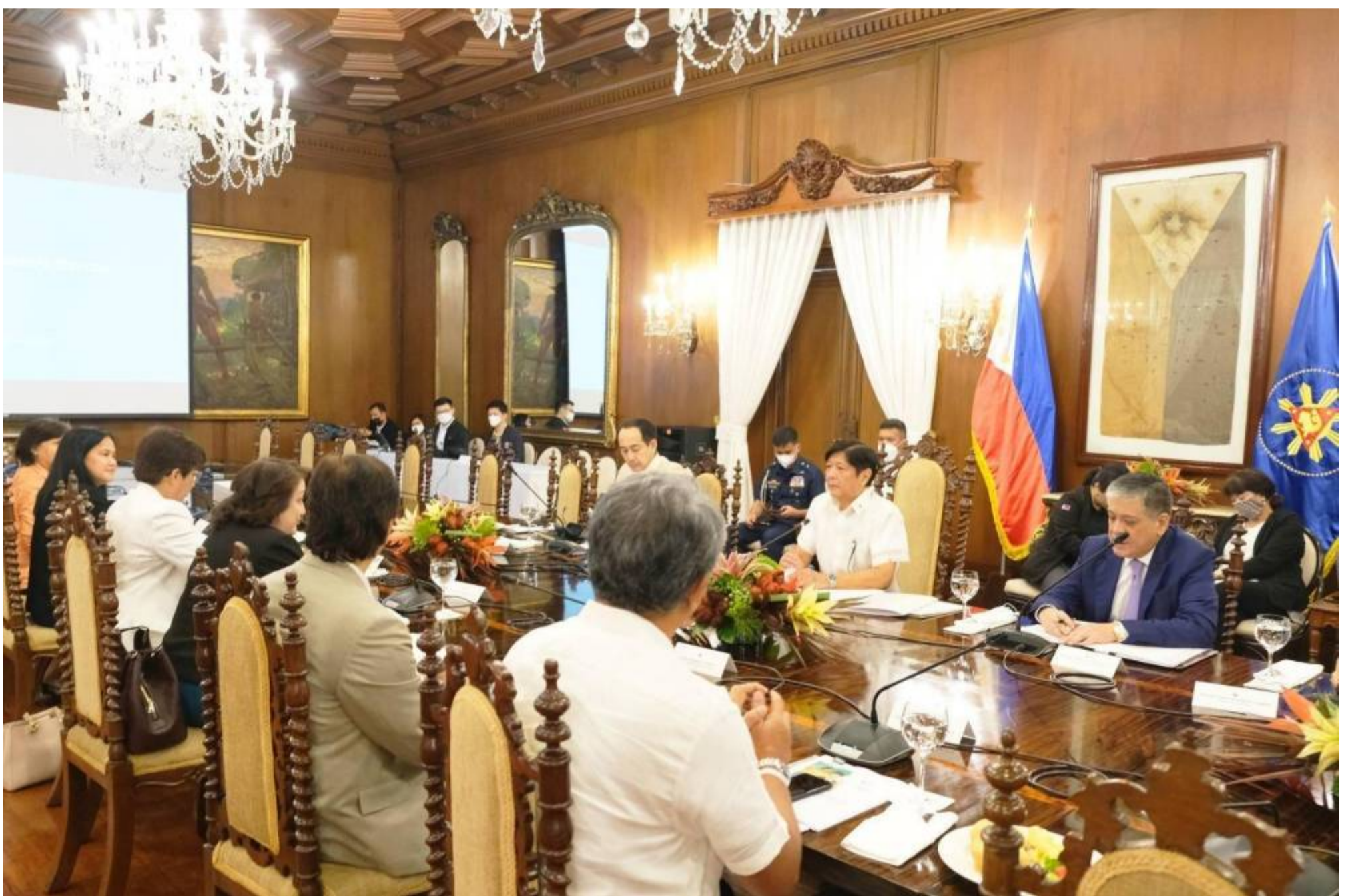
President Ferdinand ‘Bongbong’ Marcos Jr. discusses the government’s vaccination program with Health officials in Malacañang on July 6, 2022, amid the rising number of Covid-19 cases in different parts of the country.

President Ferdinand “Bongbong” Marcos Jr. called Department of Health (DOH) officials for a meeting in Malacañang to ensure that vaccinating the population against Covid-19 continues amid plans to fully reopen schools by November this year.