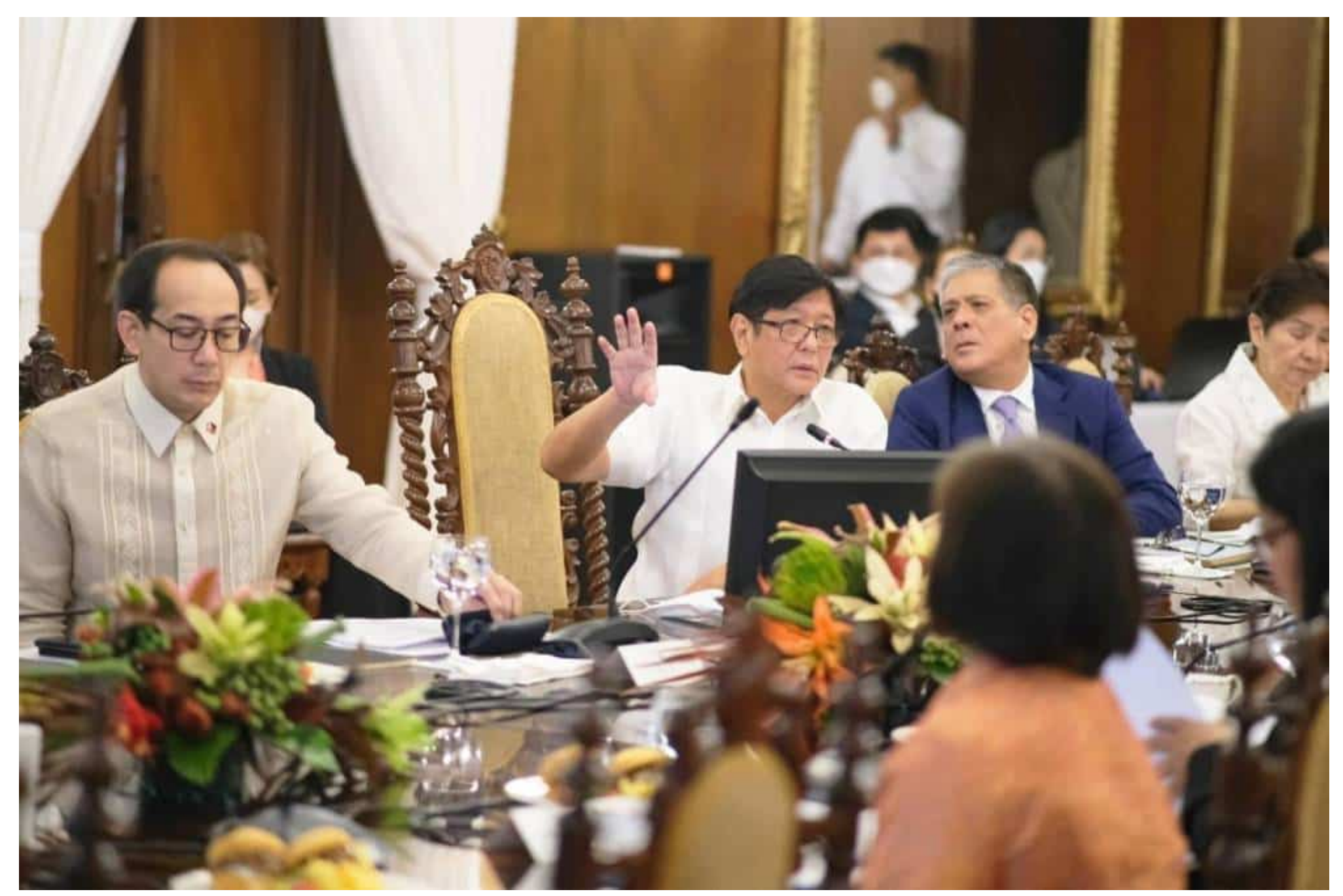
President Ferdinand 'Bongbong' Marcos Jr. discusses the government's vaccination program with Health officials in Malacañang on July 6, 2022, amid the rising number of Covid-19 cases in different parts of the country.

President Ferdinand "Bongbong" Marcos Jr. has agreed with the proposal to require Filipinos to get the first booster shot as the country attempts to arrest the spread of Covid-19 Omicron subvariants, the state media reported.