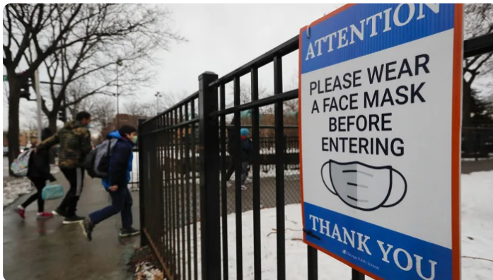
Students arrive at Budlong Elementary School in Chicago in January.

“The CDC’s COVID-19 school guidelines continue to cause significant disruption to children’s education and to working parents, while providing no demonstrable public health benefit in limiting COVID-19 spread. These policies have serious unintended consequences,” the Urgency of Normal letter argues.