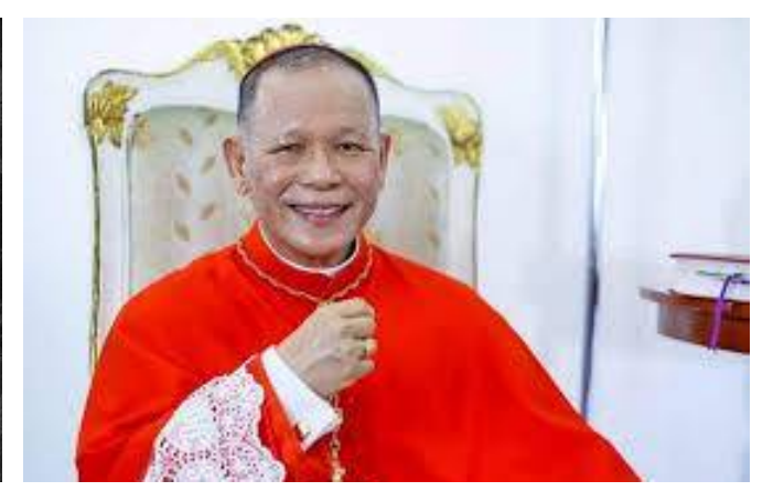
<u>Cardinal Advincula celebrates mass inside</u> <u>Manila City Jail</u>