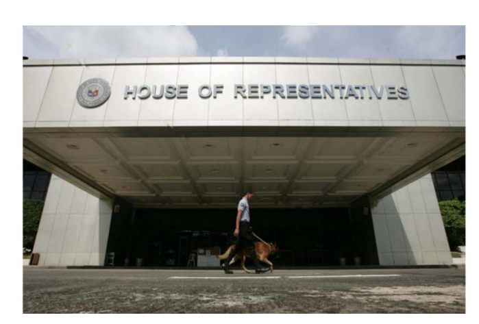
By the numbers: How the 18th Congress performed