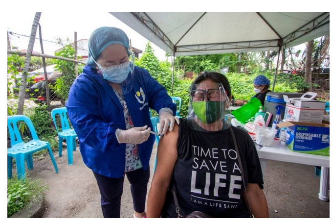
<u>Muntinlupa's weekly new Covid-19 cases</u> decrease