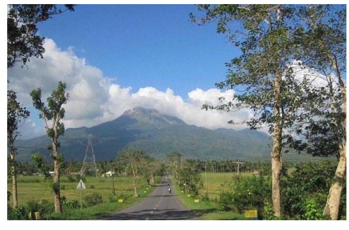
<u>106 quakes recorded at Bulusan Volcano in</u> <u>past 24 hours — Phivolcs</u>