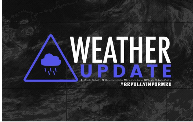
<u>Isolated rain showers, partly cloudy skies to prevail over PH</u>