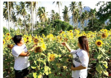
SWEET DAY With the sugarcane harvest in full swing, workers gather flowers at a farm in Alibon on Wednesday, March 16, 2022. The Blue Region is bracing for the influx of tourists as Covid-19 infections have slowed.