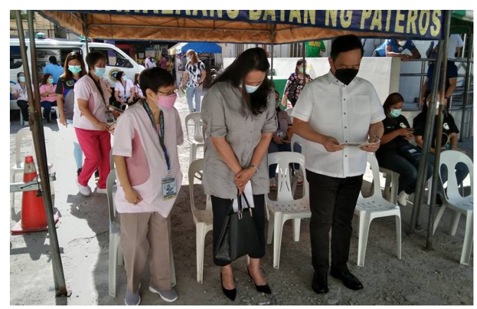
<u>Pateros LGU, DOH inaugurate newly</u> <u>renovated health center</u>