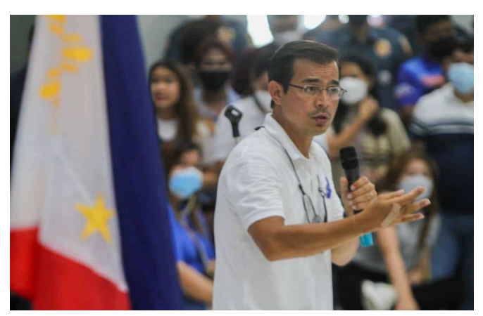
<u>Mayor Isko vows return of coco levy funds to</u> <u>farmers if he wins</u>