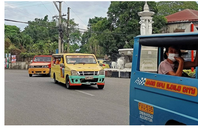
<u>Iloilo jeepney drivers, operators get P6500</u> <u>fuel subsidy</u>