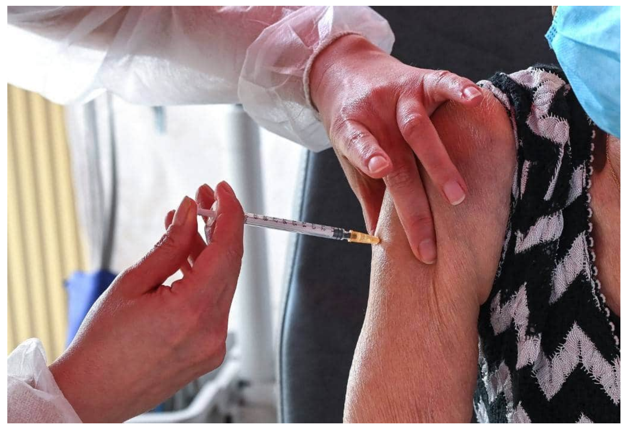
In this file photo taken on February 17, 2021 a nurse administers the Covid-19 vaccine to an elderly patient at the Dunkirk hospital. French Prime Minister announced on March 12, 2022 the opening of the fourth dose of vaccine "to the over 80s who have received their booster dose for more than three months", in the face of the slight rebound in the Covid epidemic, in an interview with Le Parisien.

Fully vaccinated Filipinos should get booster shots against Covid-19 to further increase their protection against the viral disease, an official of the National Vaccination Operations Center (NVOC) said.