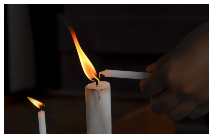
<u>90-year old mother, son die in Cagayan Fire</u>