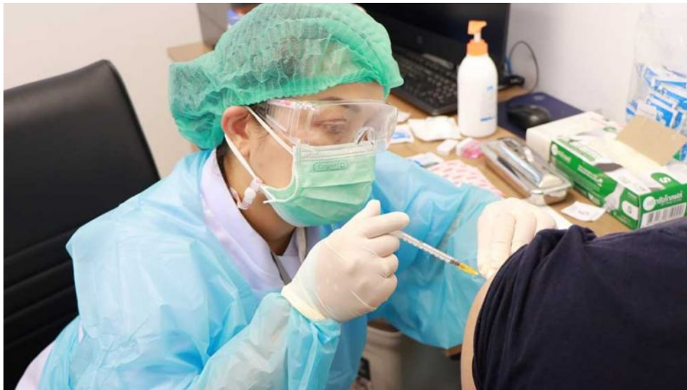
A Thai health worker administers a Covid-19 shot to a man.

Thailand's National Health Security Office (NHSO) has so far paid 1.509 billion baht ($45.65 million) as compensation to 12,714 people who developed side-effects after they received Covid-19 vaccines.