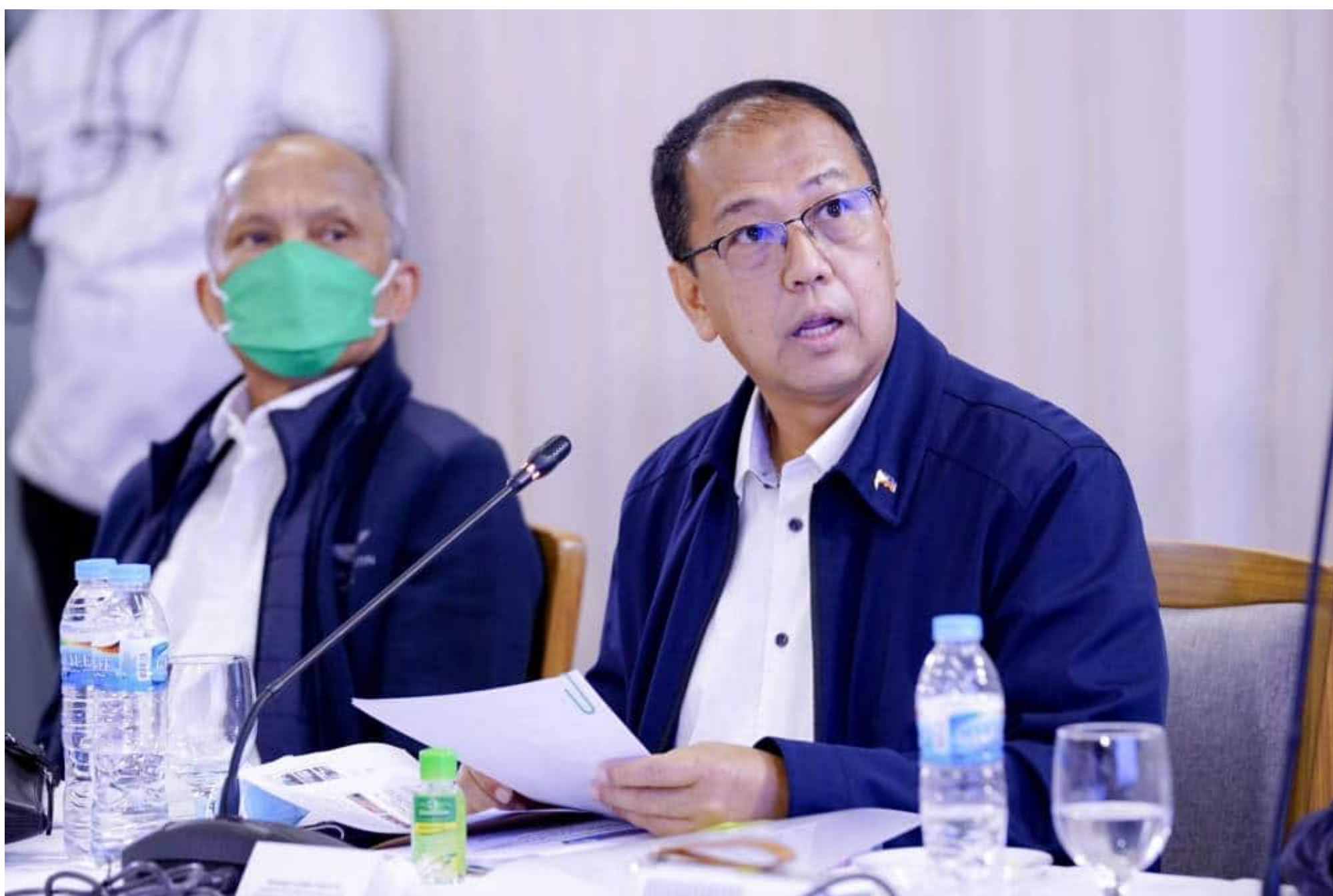
Vaccine czar Carlito Galvez Jr attends the pre-recorded Talk to the People public address of President Duterte aired on March 16, 2022. Behind him is Department of Energy Secretary Alfonso Cusi.

The country is experiencing a continuous decrease in the number of people who are getting vaccinated against Covid-19 despite the high level of willingness of the public to get inoculated.