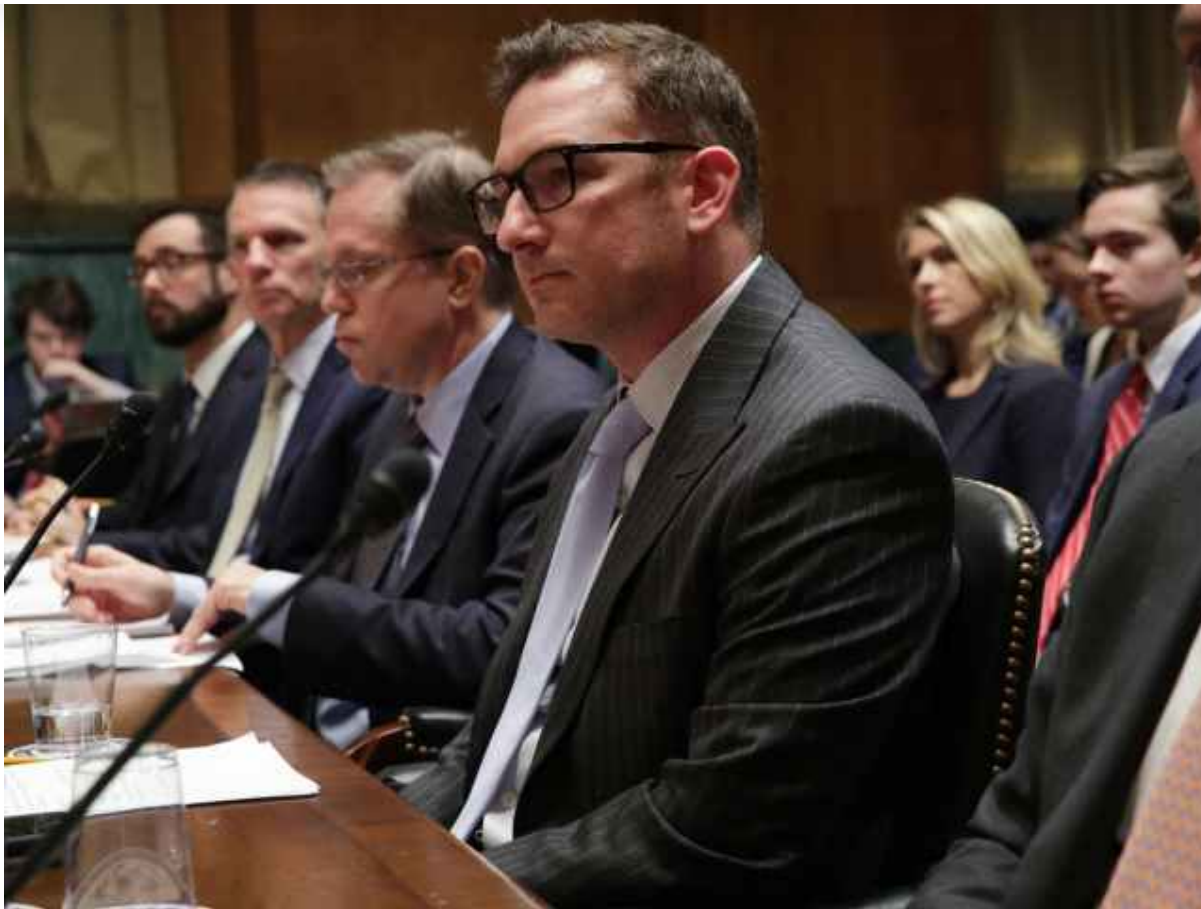
DuckDuckGo CEO Gabriel Weinberg

DuckDuckGo CEO Gabriel Weinberg tweeted about the decision, stating that it was an effort to reduce Russian disinformation online. “Like so many others I am sickened by Russia’s invasion of Ukraine and the gigantic humanitarian crisis it continues to create. #StandWithUkraine,” Weinberg stated, adding: “At DuckDuckGo, we’ve been rolling out search updates that down-rank sites associated with Russian disinformation.”