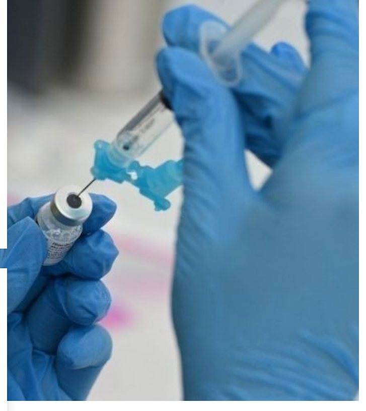
ige with Pfizer COVID-19 vaccine at a community igust 11, 2021.