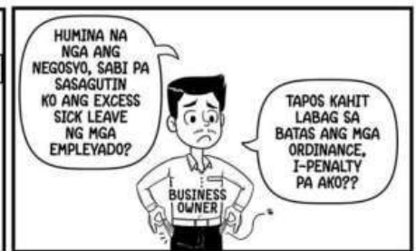
No Sales, No Business Tax