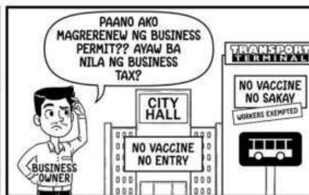
No Vaxx, No Ride / No Vaxx, No Entry