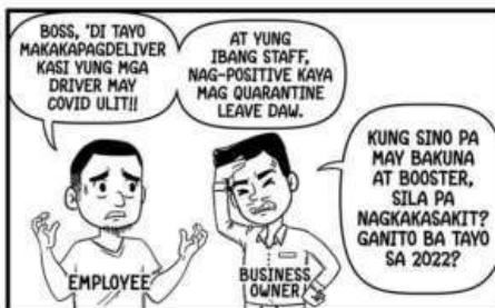
Breakthrough surge in company hampers business operation