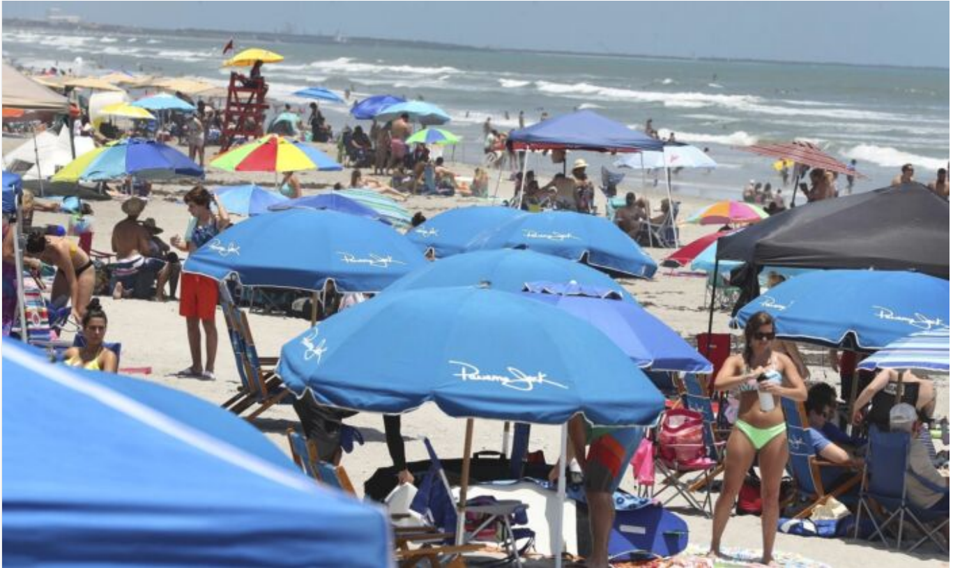
Cocoa Beach, Fla., is packed with Memorial Day beachgoers on May 23, 2020.