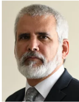
Dr. Robert W. Malone , gene therapy, bio-defense, vaccines and immunology; discoverer of in-vitro and in-vivo RNA transfection and architect of mRNA vaccine platform