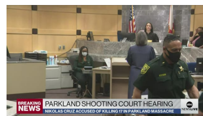
24/7 coverage of breaking news and live events