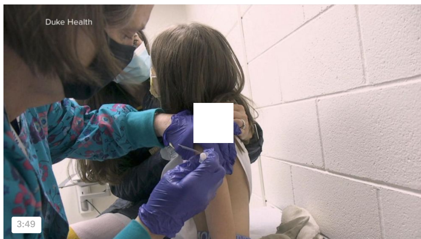
Pfizer applies for authorization of vaccines for kids 5 to 11 years old Pfizer has submitted for FDA vaccine authorization for kids 5 to 11, which means the sho... Read More ABCNews.com

COPENHAGEN, Denmark -- Finland has joined other Nordic countries in suspending or discouraging the use of Moderna's COVID-19 vaccine in certain age groups because of an increased risk of heart inflammation, a rare side effect associated with the shot.