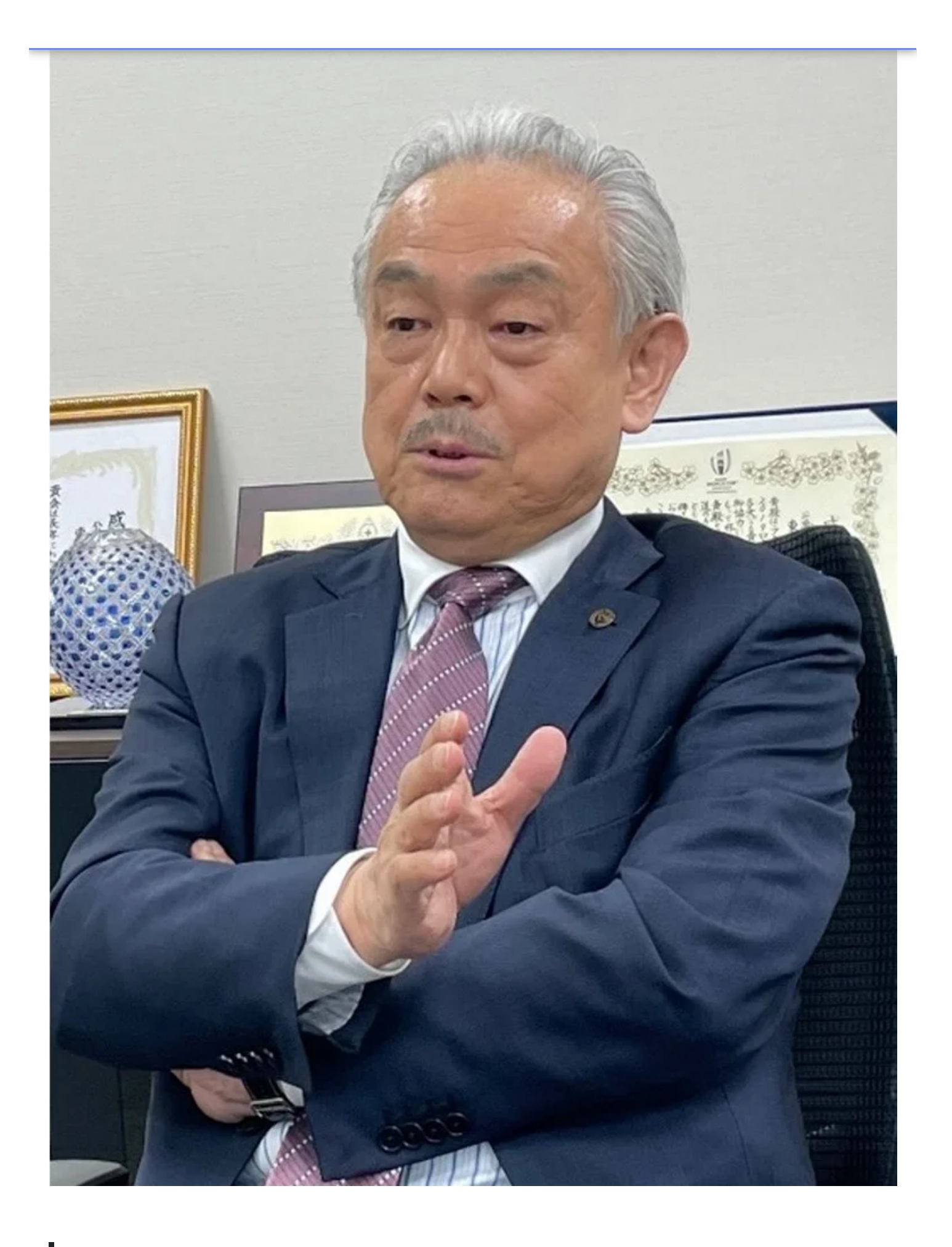
The peak of infection spread that is not yet visible