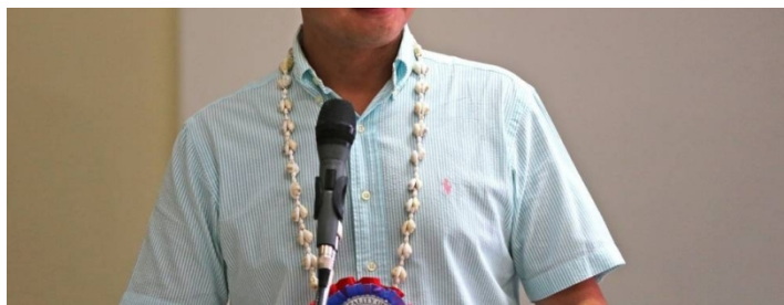
Sen. Sherwin Gatchalian.

SEN. Sherwin Gatchalian on Thursday said a Pulse Asia survey that he recently commissioned showed the vulnerability of poorer households to the impact of school closures because of the Covid-19 pandemic.