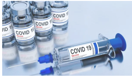
How the COVID Scam Is Perpetrated: Dr. Paul Craig Roberts 26 July 2021