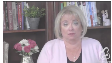
Seeing Through the COVID Spin 11 May 2021