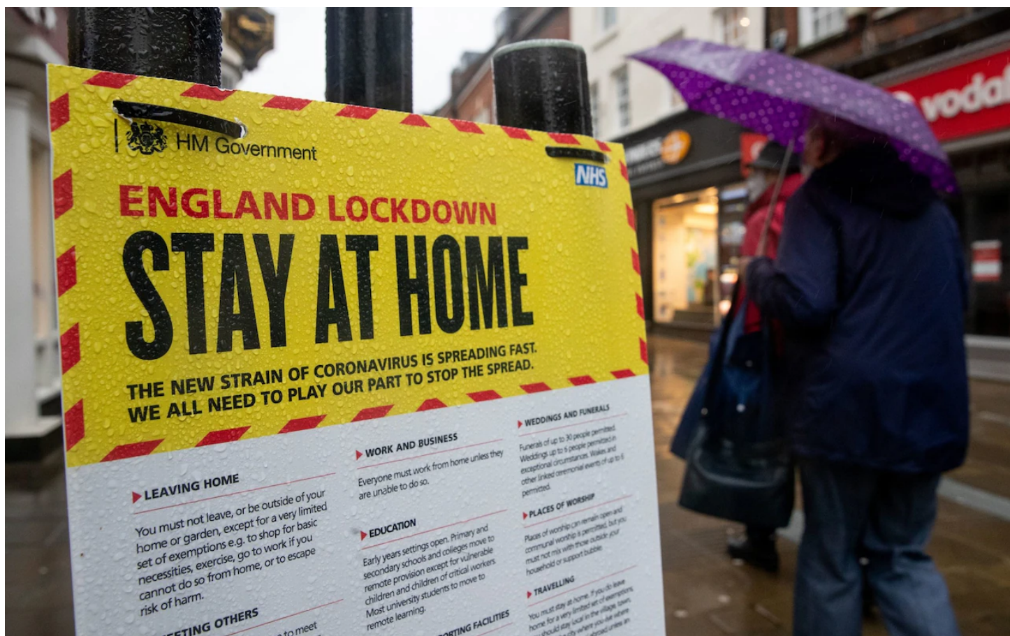
Ministers have been accused of ramping up the threat from the pandemic to justify lockdowns

SPI-B is one of the sub-committees that advises the Scientific Advisory Group for Emergencies (Sage), led by Sir Patrick Vallance, the chief scientific adviser.