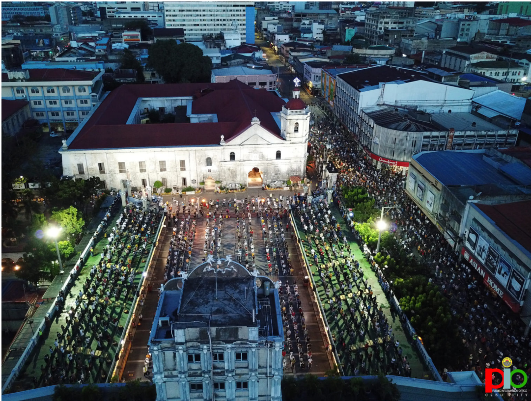
An aerial view of the situation inside and outside Basilica Minore del Sto. Niño during the 2nd day of the Misa de Gallo on Dec. 17.