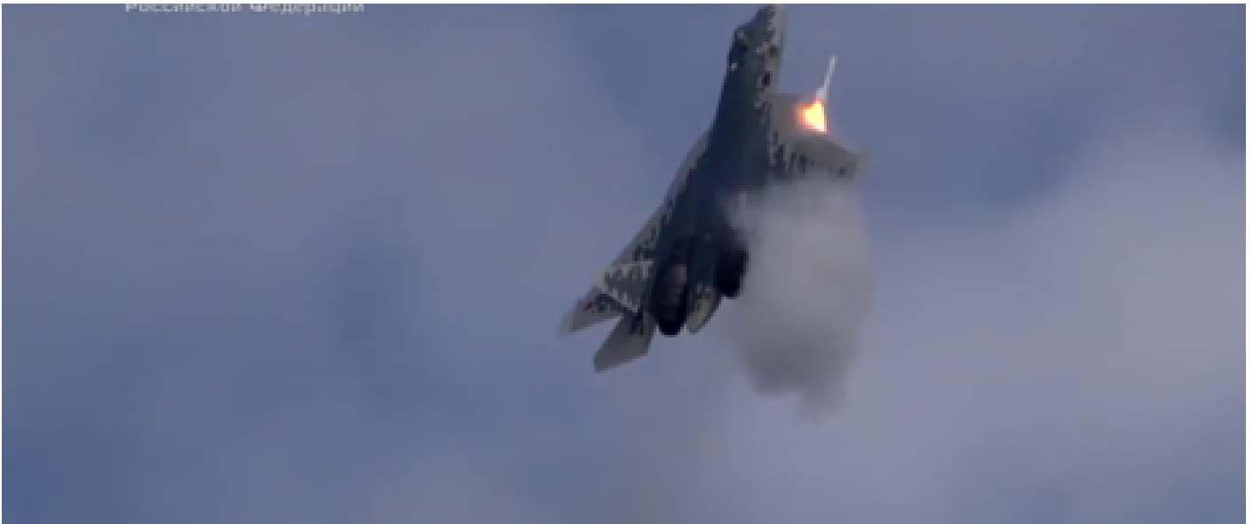
Watch Russian Su-57 fire missile during NEAR-VERTICAL CLIMB as pilots master new jet's capabilities (VIDEO)

Time to get outta Dodge? Kansas mayor resigns in FEAR FOR HER SAFETY after comments favoring mask mandate led to threats