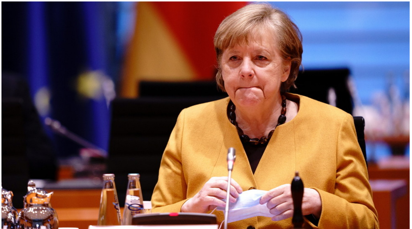
German Chancellor Angela Merkel attends the weekly cabinet meeting at the Chancellery in Berlin, Germany, March 24, 2021.