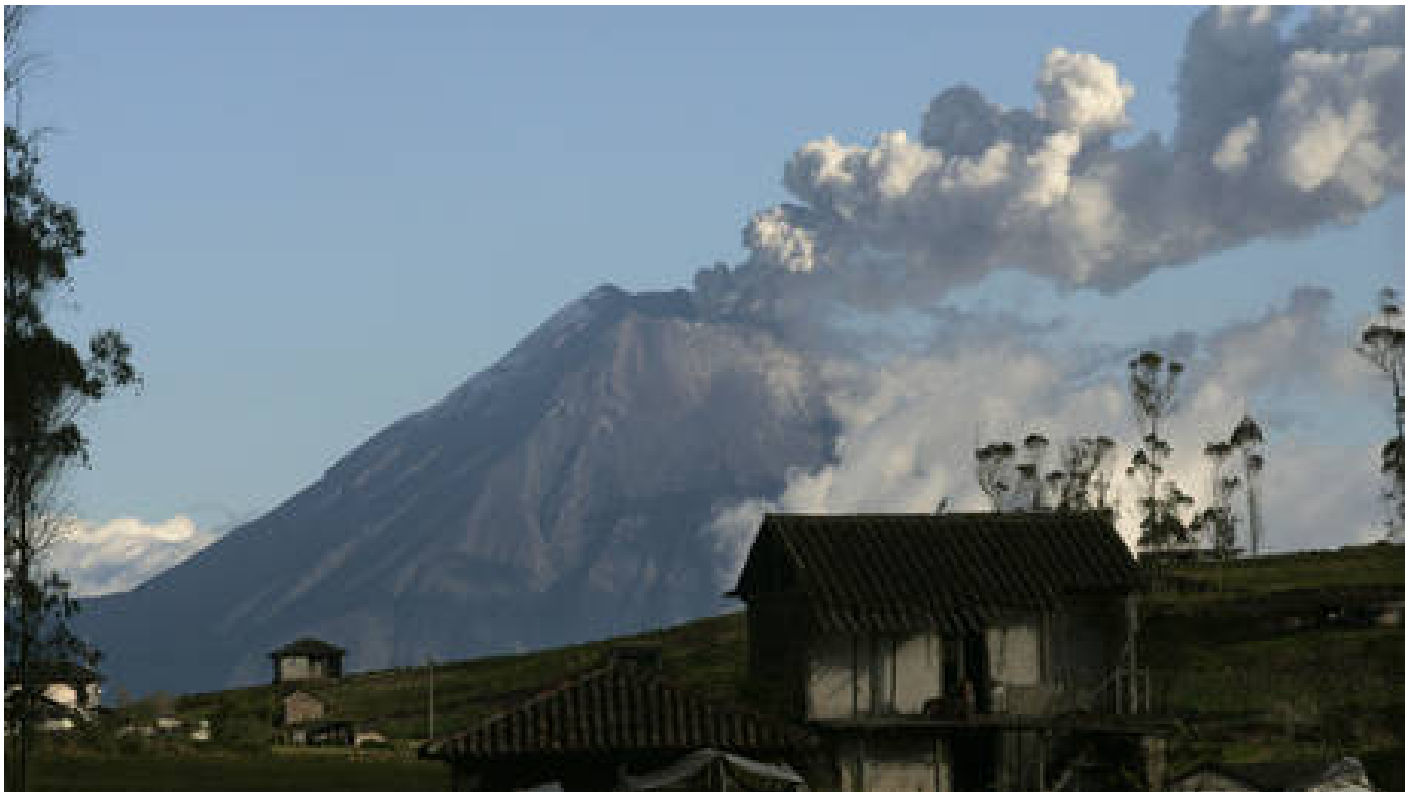
'Throat of fire' volcano signalling imminent, devastating COLLAPSE