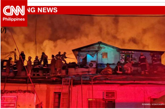
Malate fire leaves one dead, around 200 families homeless — BFP (/news/2021/3/9/Malate-fire.html)