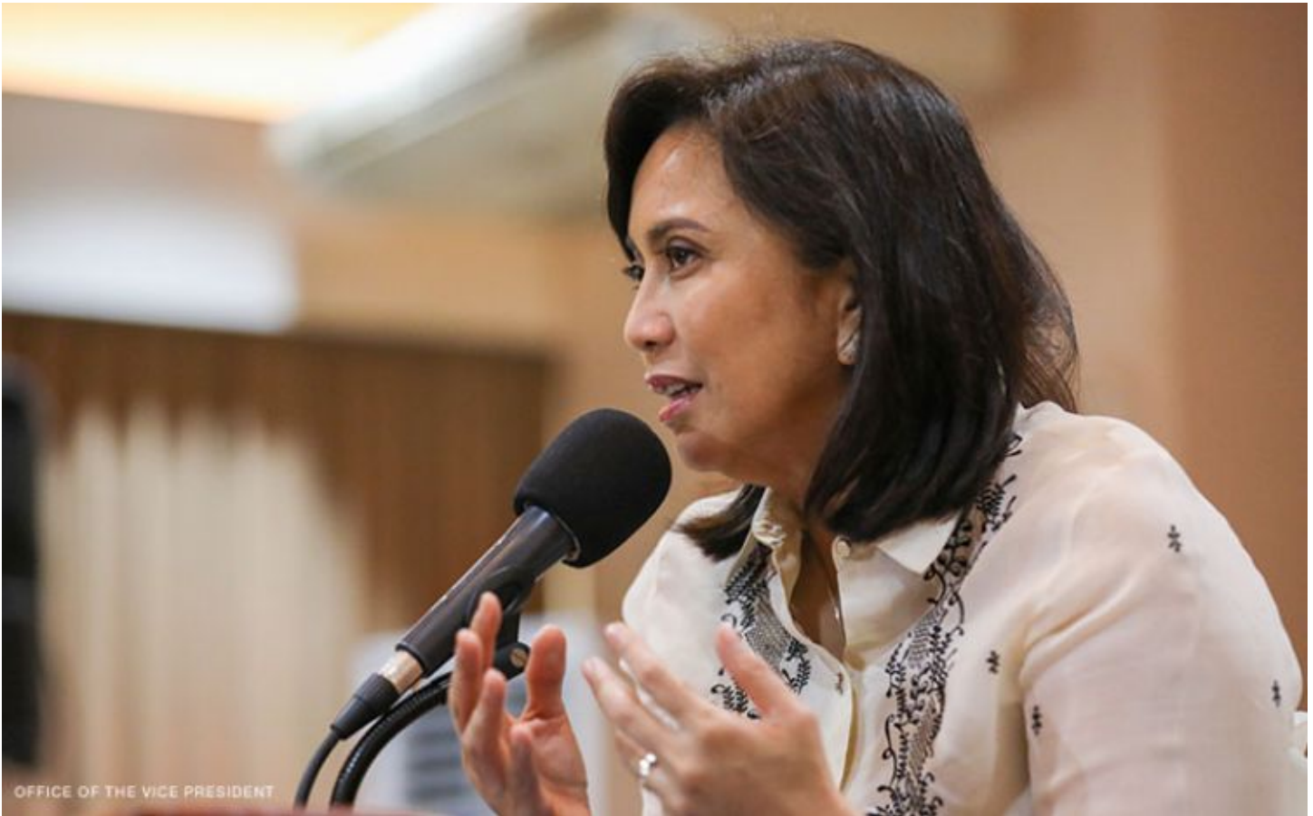
OFFICE OF THE VICE PRESIDENT

(/news/2021/3/9/Robredo-Calabarzon-massacre-activists.html)