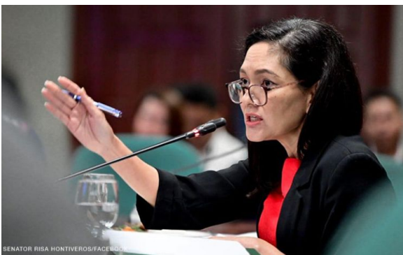
SENATOR RISA HONTIVEROS/FACEBOOK

Robredo slams Calabarzon 'massacre' (/news/2021/3/9/Robredo-Calabarzon-massacre-activists.html)