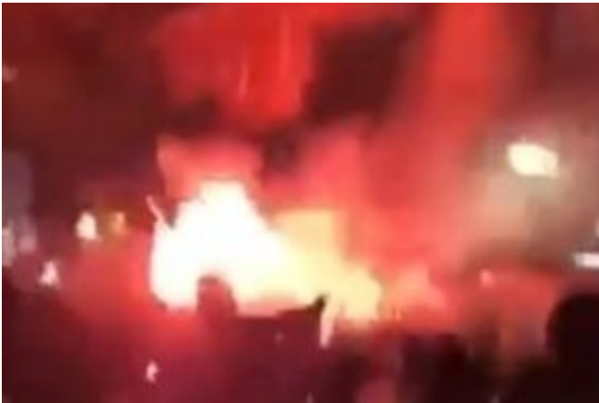
Europe CHAOS: Riots erupt in Netherlands- protesters clash with police

(/news/world/1388874/eu-news-netherlands-protest-fire-holland-police-riots-arrest-Rotterdam-france-curfew-covid)