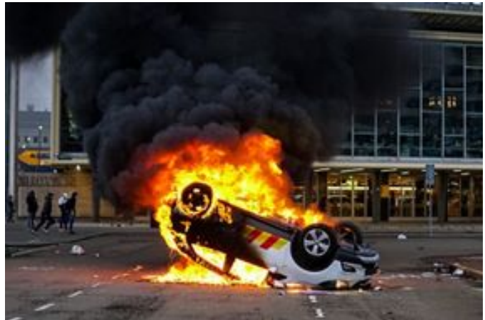
EU in flames: Netherlands lockdown riots set to cause 'civil war'

(/news/world/1388874/eu-news-netherlands-protest-fire-holland-police-riots-arrest-Rotterdam-france-curfew-covid)