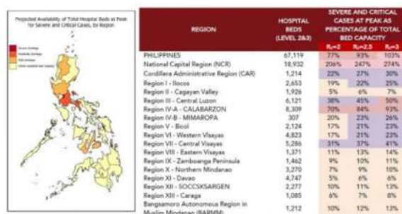
Figure 2. Projected availability of hospital beds at the regional level during peak.

On the projected availability of ICU beds corresponding to critical COVID cases at the provincial and regional levels (Figure 3), we estimate that it is beyond the capacity of most provinces to handle the surge of the COVID-19 crisis in the Philippines at its peak. There is a lack of available critical care beds because across the country, there are only a little over 2,000 ICU beds to cater to the projected 8,800 to 19,800 critical COVID-19 cases.