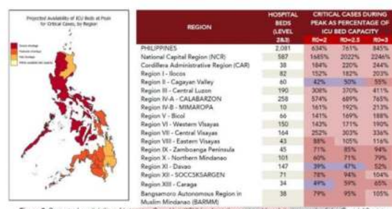
Figure 3. Projected availability of Intensive Care Unit (ICU) beds at the regional level during peak of the Covid-19 crisis.